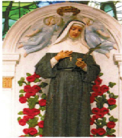
St. Rita of Cascia is the Patroness of the Impossible

Veneration of the Relic of St. Rita will be available daily. Healing Mass and a Blessing with the St Rita Oil on May 21st; Blessed roses will be distributed on the Feast Day Masses on May 22nd.