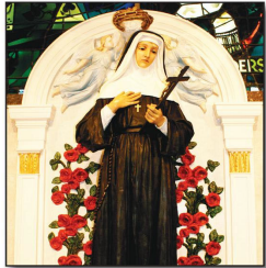
St. Rita of Cascia is the Patroness of the Impossible

Veneration of the relic of St. Rita will be available daily & Veneration of the relic of St. Padre Pio will be available May 20 th -22 nd Blessed Roses will be distributed at the Feast Day Masses on May 22 nd