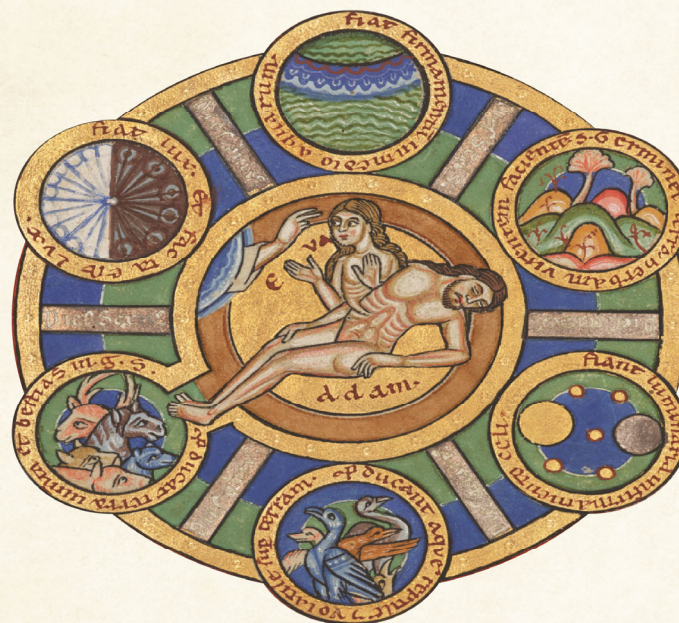
Detail, Anonymous, The Creation of the World , Germany, c. 1170s