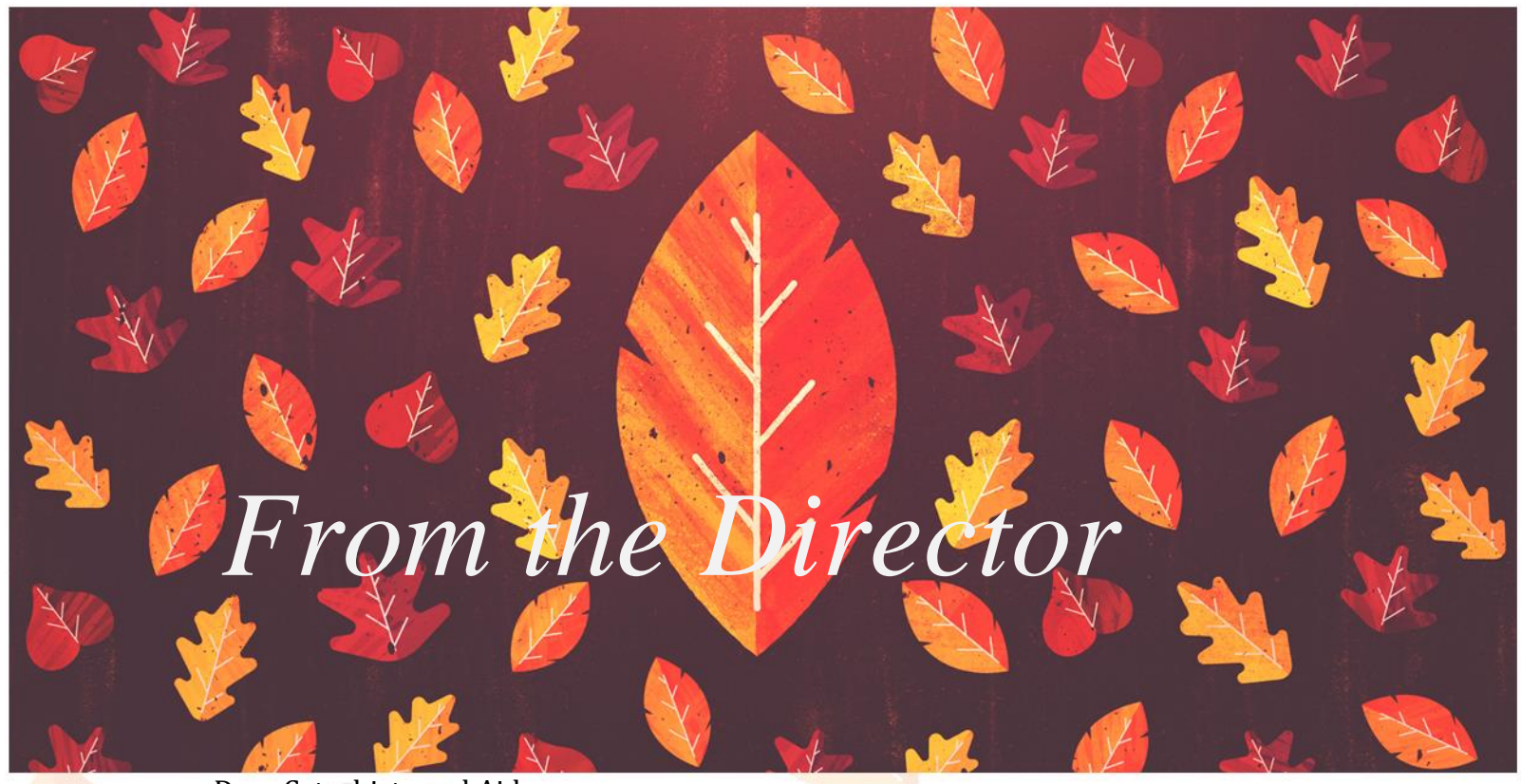
Dear Catechists and Aides,

Thank you all for a successful first evening of the continuing formation and education of our students here at Most Holy Redeemer. There were a few blips on the radar such as our new students needing assistance getting to their classroom. I want to thank the three 8th grade students from Most Holy Redeemer School that came to help us by escorting the students to their classrooms. We still need a 6th grade Catechist. We have NO ONE to lead this grade level. We have had several generous volunteers sub in since we started, but we need someone to commit to being the students formational/educational leader. If you cannot do it, perhaps you know someone who can. Please reach out to them and ask them to be part of this rewarding ministry.