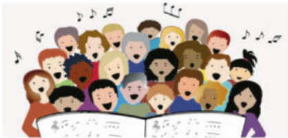
the MHR Parish Christmas Choir!

Choir practice will resume this Wednesday, November 6 th , 2024.